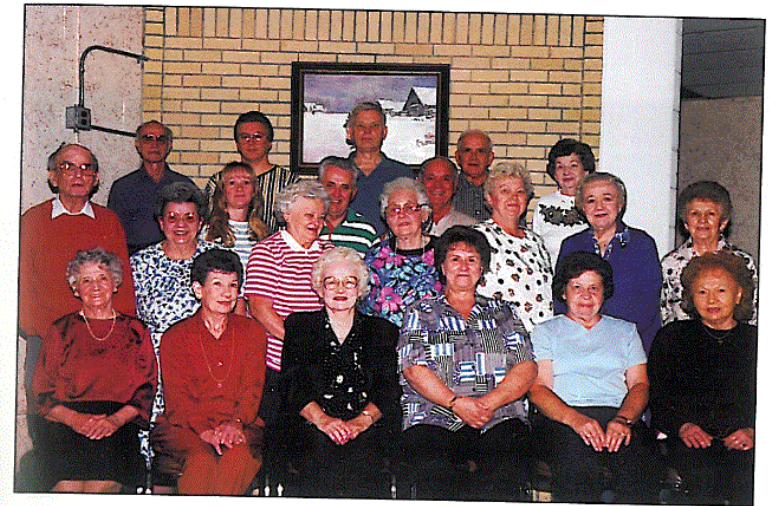
Social Game Workers