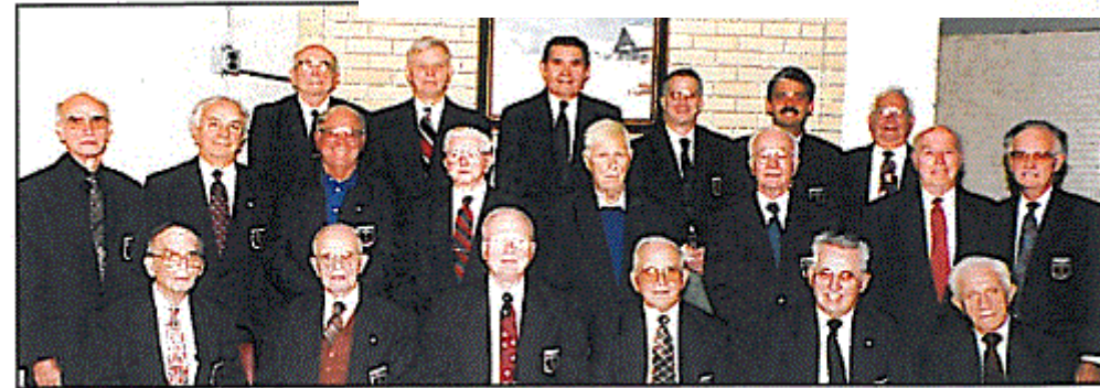
Holy Name Society