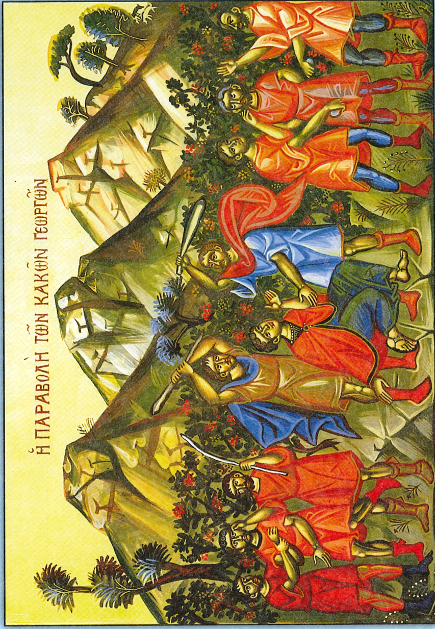
Icon of the Wicked Tenent Farmers (Matthew 21:33-42)