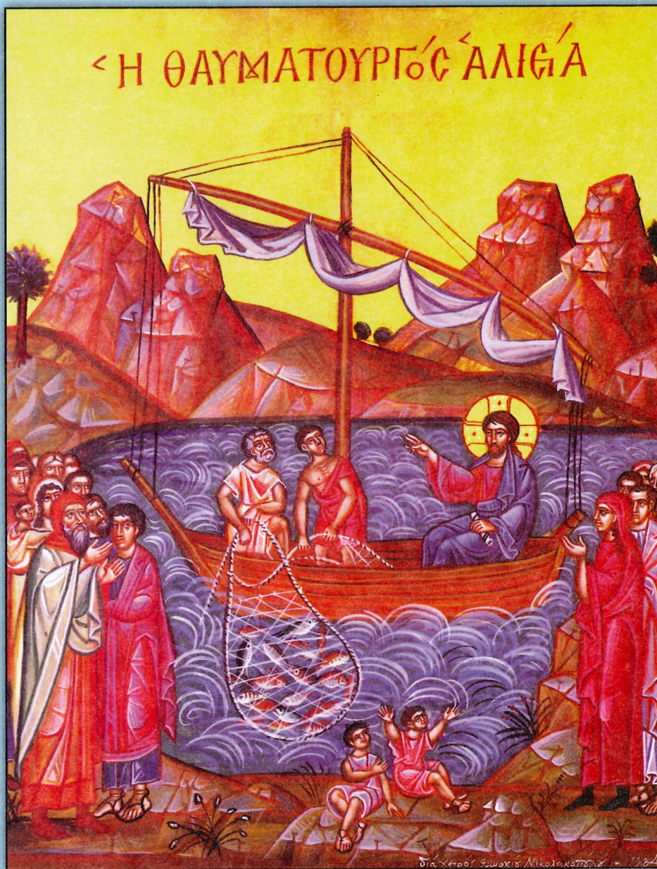
Icon of the Catch of Fish (Luke 5:1-11)