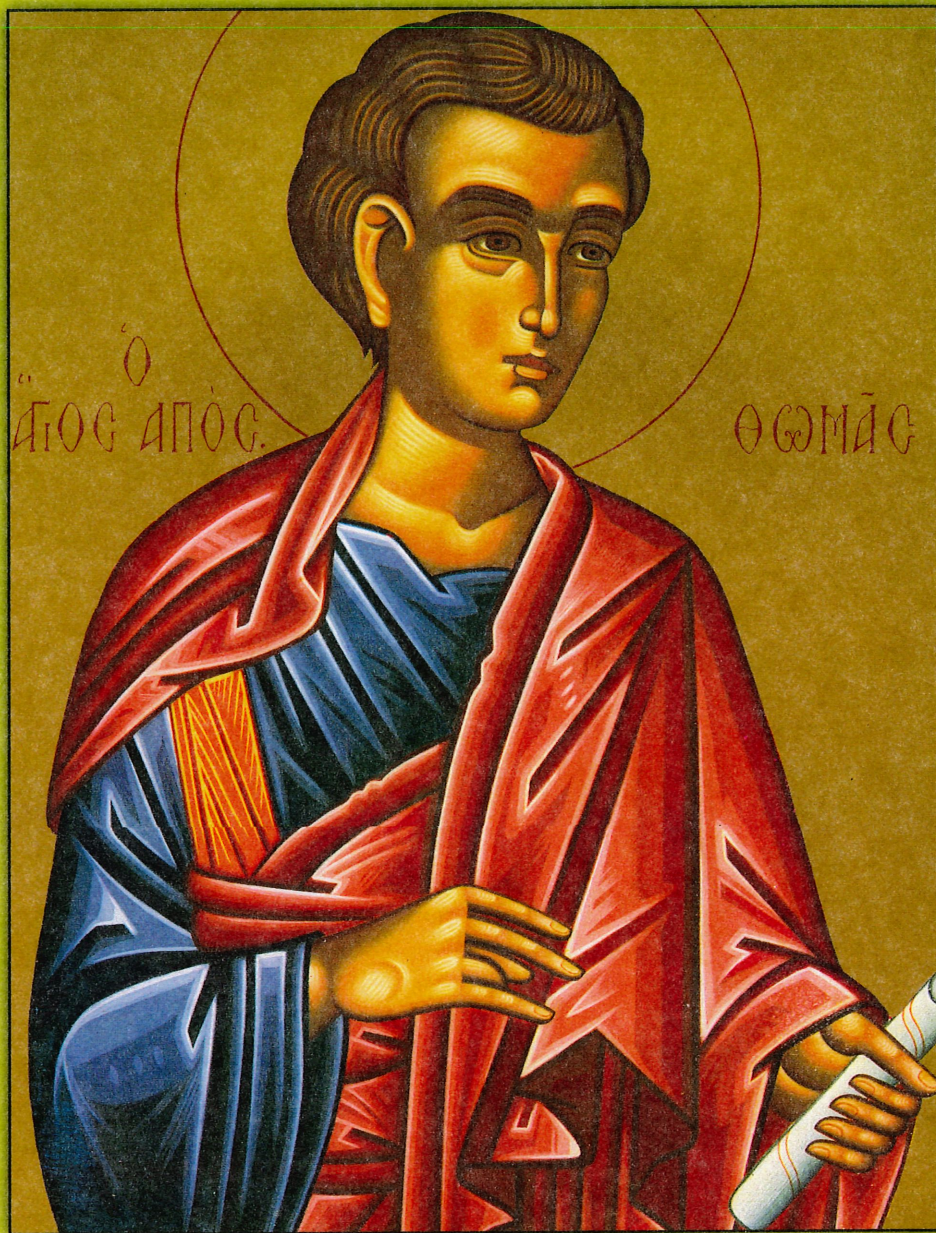
Icon of Saint Thomas -- October 6th