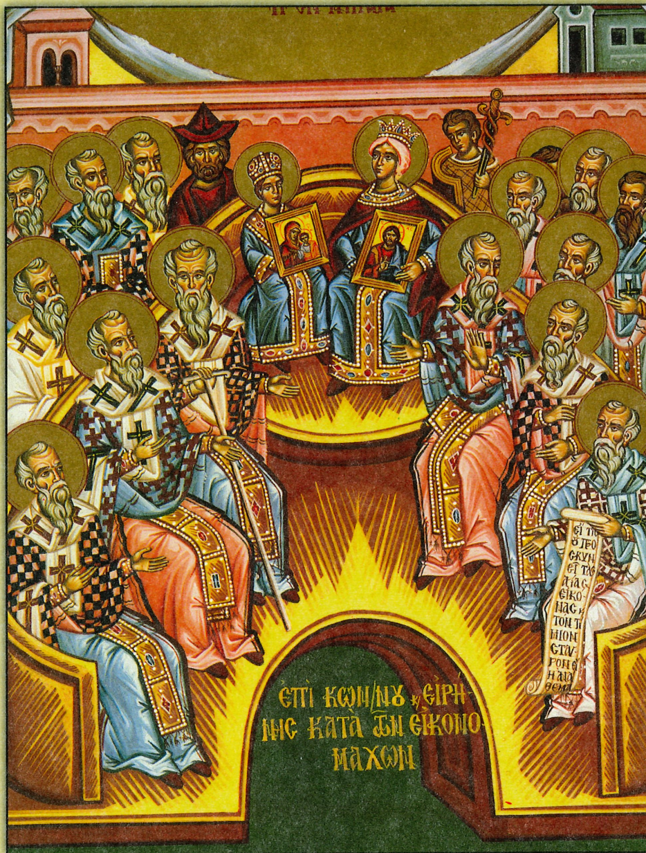
Icon of the Fathers of the Seventh Ecumenical Council